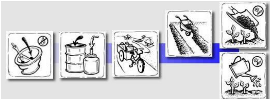
Example of a sanitation chain with a diversion toilet, separate storage for excreta and urine, transport of tanks, composting and re-use of manure and urine.

step 7: Define with the most relevant stakeholders for the selected chain elements the most relevant design parameters that came up from the discussions (related to target groups, age level etc.) and hand these specifications/list of preferences to a design engineer.